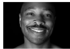
Kyle Abraham Choreographer River Without Banks