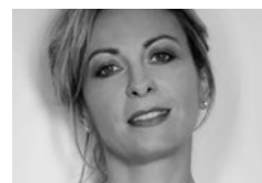
Natalie Dessay Soprano Candide