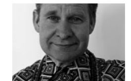
Peter Sellars Director Only the Sound Remains