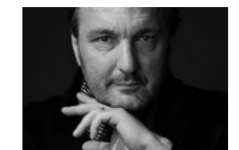
Ludovic Tézier Baritone Récital