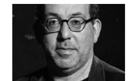
Barrie Kosky Director The Threepenny Opera