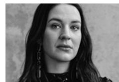
Lise Davidsen Soprano Recital