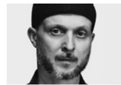
Sidi Larbi Cherkaoui Choreography Dimokratia