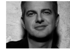
Philippe Jaroussky Countertenor Only The Sound Remains