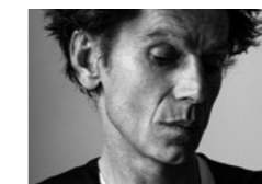
Krzysztof Warlikowski Director Theodora