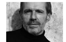
Lambert Wilson Baritone Candide